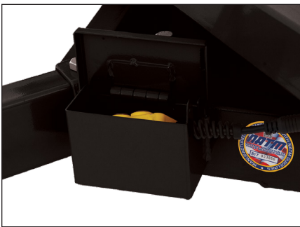
Protected Remote Holder