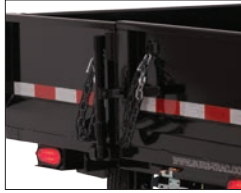
Barn Doors with Cambar