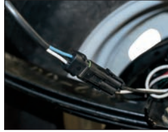
Sealed Brake Connections