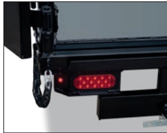
All LED Lights