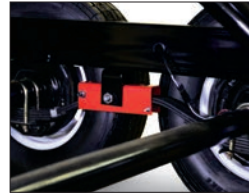
Slipper Spring Suspension