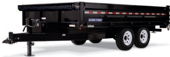
Shown with Optional Tarp Kit