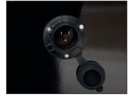
110 Volt Battery Charger