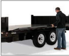
Easy Fold-Down Side Panels