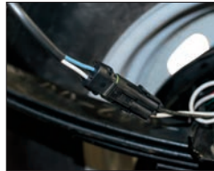
Sealed Brake Connections