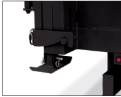
Stabilizer Jack Receivers (Jacks Optional)