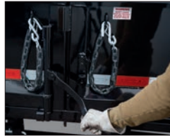
Cambar Rear Door Latch