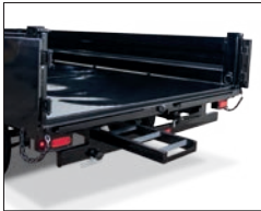
Easy-Access Ramp Storage