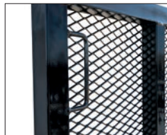
Ramp Gate with Handle