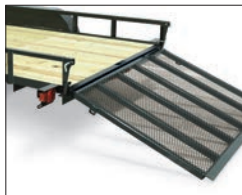
Fold-Flat HD Ramp Gate